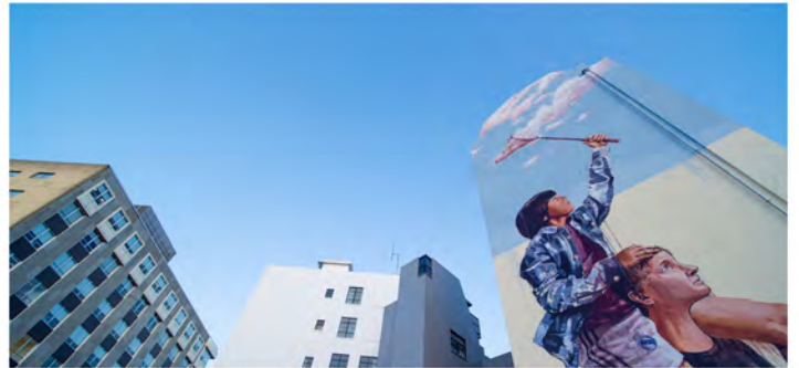
Dunedin Street Art

Explore Dunedin's colourful and quirky street art, with over 100 works from local and international artists woven amongst the stunning heritage buildings.