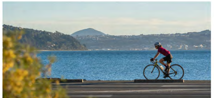
Otago Harbour Path

Rent a bike and cruise waterside along the stunning Otago Harbour path, with transfers available by cycle ferry. Explore world-class mountain bike trails or head for the Otago Central Rail Trail in Middlesmarch.