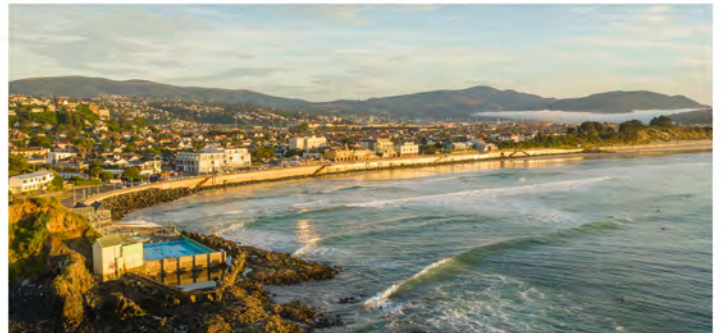
St Clair Beach

Dunedin's spectacular coastline offers a mix of white sand beaches, serene inlets, dramatic sea arches and hidden caverns. Find a spacious spot to soak up the views or head to the popular beaches right next to the city.