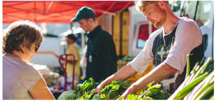
Otago Farmers Market

Set beside the Dunedin Railway Station, the Saturday Otago Farmers Market showcases delicious local produce and artisan foods, revealing the city's passionate foodie culture. The perfect place to pack a picnic for a cycle trail or walk.