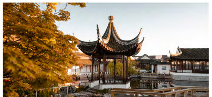
Lan Yuan Dunedin Chinese Garden

Make a day of touring Dunedin's distinctive garden selection. Whether it be the Botanic, Chinese or the harbourside gardens of Glenfalloch, you'll enjoy a range of green open spaces, florals and spectacular Chinese architecture.