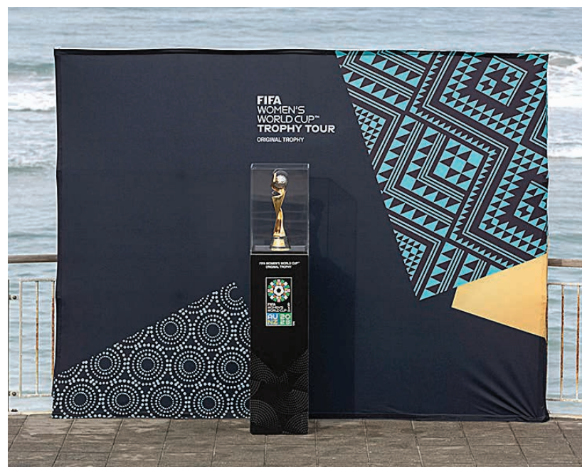
The official FIFA Women's World Cup™, pictured at St Clair for the Dunedin Polar Plunge last month.

We'll also be throwing a FIFA-sized party to celebrate. From 20-30 July, the FIFA Fan Festival™ will be the soul of the tournament. Hosted at the Dunedin Town Hall and Glenroy Auditorium, it's an entirely free and family friendly programme, featuring some of our favourite music artists such as Bic Runga, Ladió, Ladyhawke, and The Topp Twins.