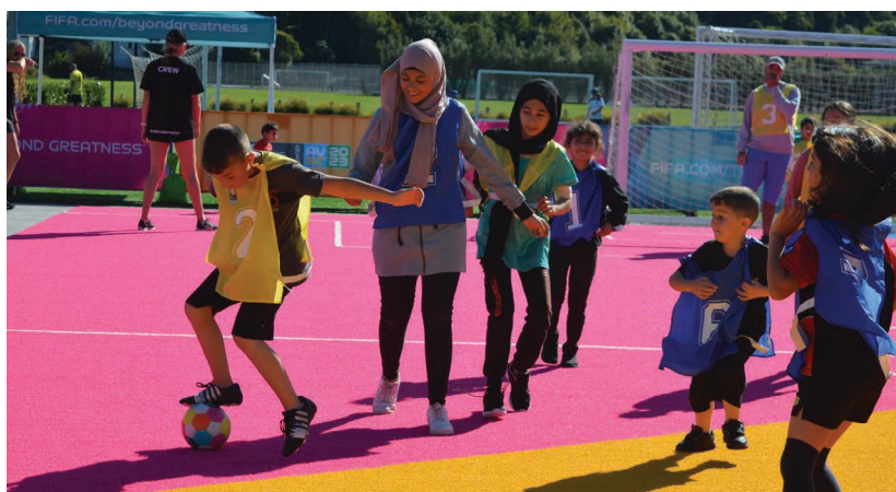
The FIFA Women's World Cup 2023™ Unity Pitch, which visited the Artificial Football Turf at Logan Park in March, is a patchwork reflecting the local cultures and the coming together of the 32 participating nations.

In line with FIFA's Beyond Greatness™ campaign to inspire future female football talent, we're shining the spotlight on some of Aotearoa's own talented women. As well as our stellar line-up of musicians, we'll profile local football and sporting talent and will host the EQUALIZE programme by NZ Story, which is a series of talks featuring trailblazing women. We also have a special projection mapping project on St Paul's Cathedral and a new street mural outside the Municipal Chambers building in the