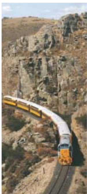
The spectacular rail journey through the Taieri Gorge

be closed. Then in 1990 NZ Railways officially closed the Central Otago line. The Dunedin City Council bought and preserved the Taieri Gorge sector of the rail track, which is within its city boundary, to ensure continued access to this remarkable piece of Dunedin's history.