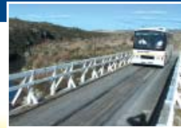
The bridge over Sutton stream near Pukerangi