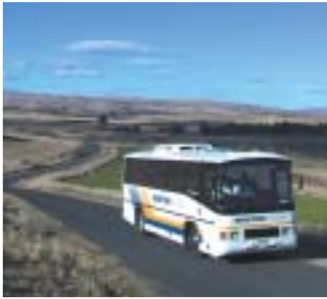
Time stands still in the tranquil high country farmland.