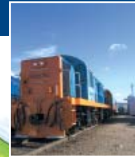
The 'Track & Trail' coach & train meet up at Pukerangi, the 'hill of heaven'